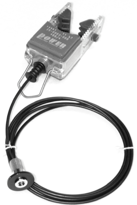
Remote Fiber Optic on FCI

Automatic reset is accomplished by time passage of 2 or 4 hours. Trip levels are discrete and factory adjusted to the customers requirements from 100 to 2000 amps. Trip speed is selectable from one of three time current curves. These curves are defined as D (delayed), U (undelayed) and D/U (delayed/undelayed). Please refer to Time/Current Curves in the applications section of the catalog for precise timing curves.